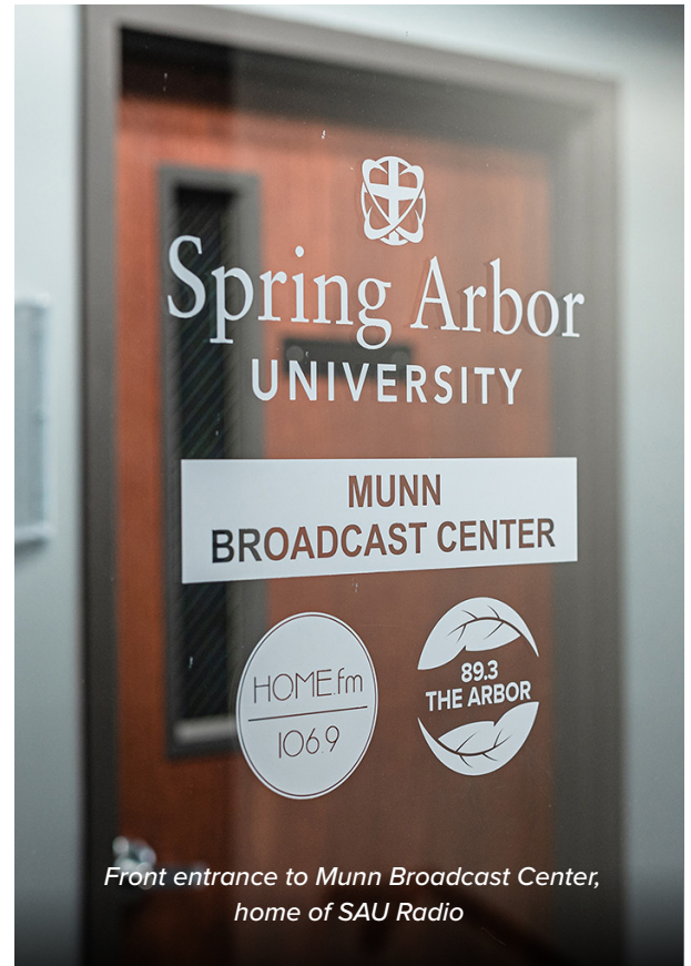
Front entrance to Munn Broadcast Center, home of SAU Radio